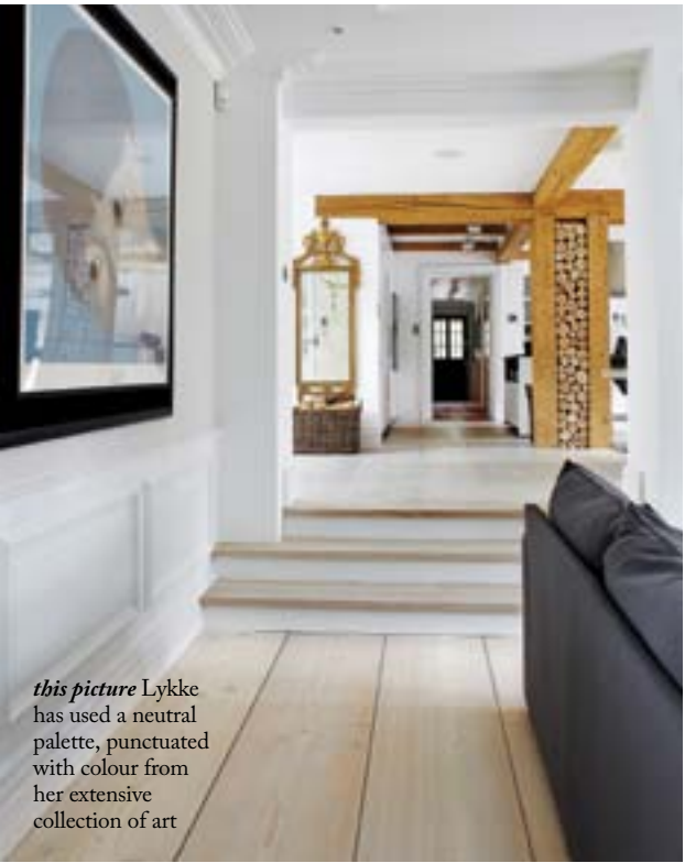
this picture Lykke has used a neutral palette, punctuated with colour from her extensive collection of art