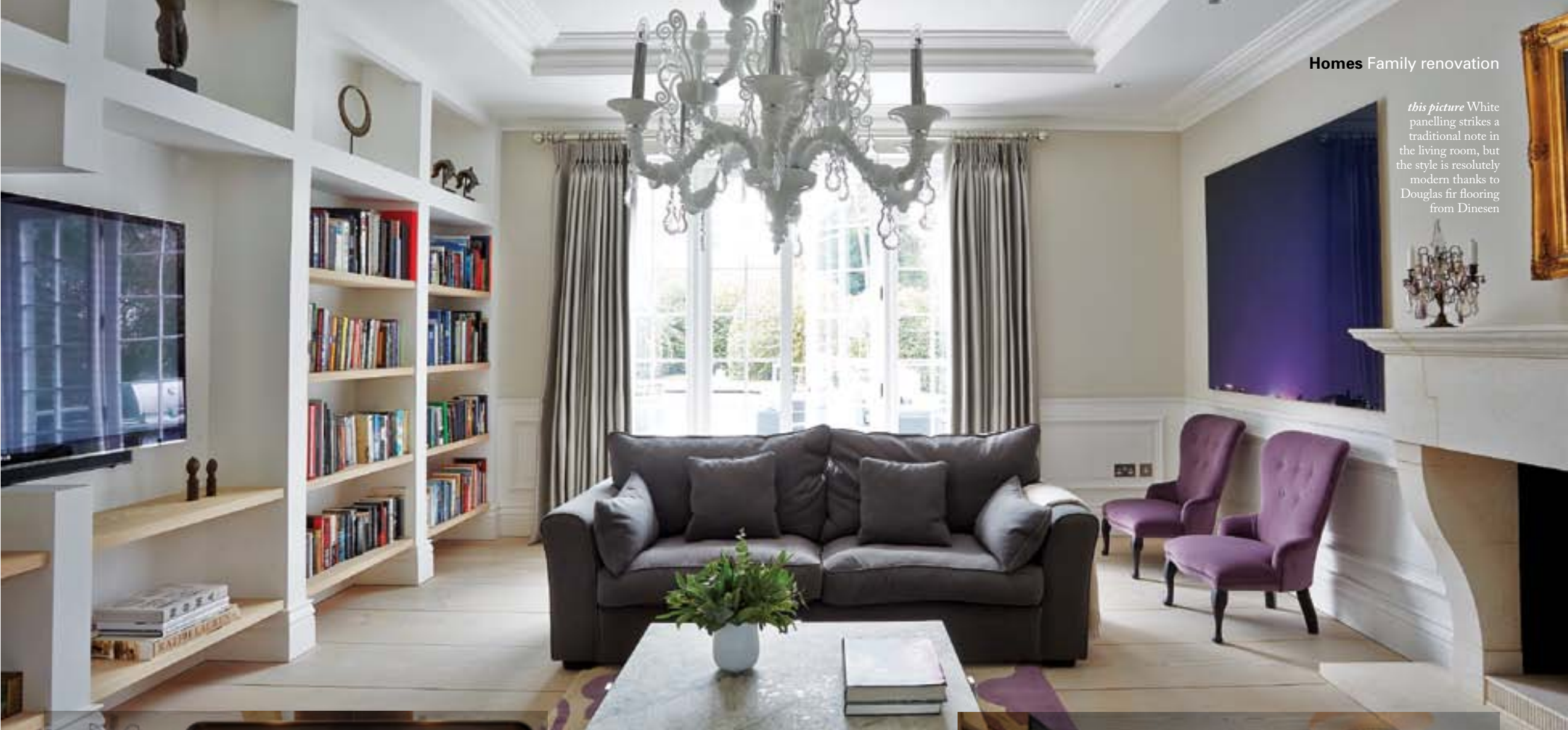
this picture White panelling strikes a traditional note in the living room, but the style is resolutely modern thanks to Douglas fir flooring from Dinesen