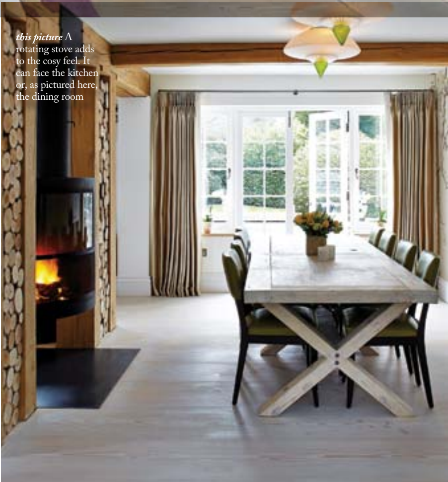
this picture A rotating stove adds to the cosy feel. It can face the kitchen or, as pictured here, the dining room