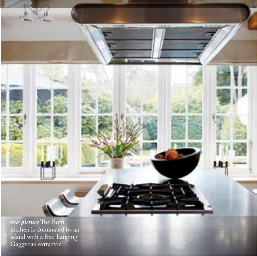
this picture The Boffi kitchen is dominated by an island with a free-hanging Gaggenau extractor